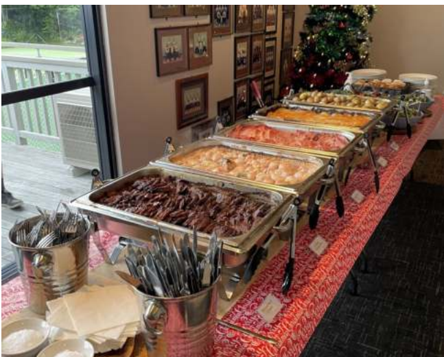
(Above: Food catered by Matt Clark from Fig & Oak)