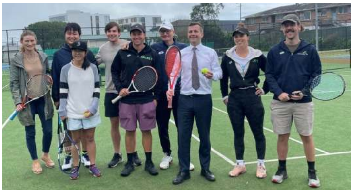
Guess the best dressed! A celebrity appearance from David Seymour.