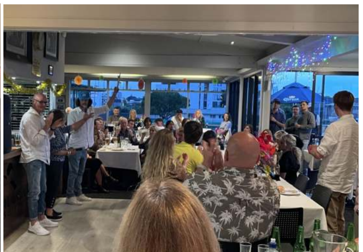
(Above: Speeches presented before Christmas dinner!)