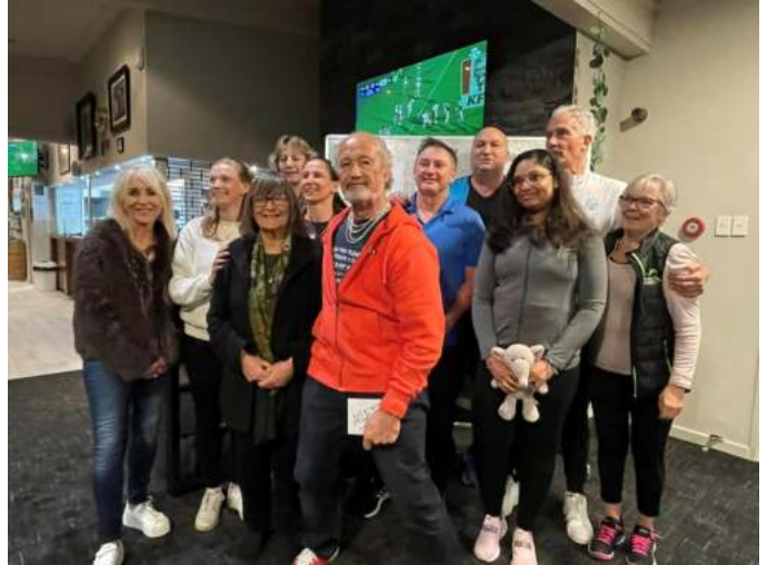
(Above: Our winners and wonderful event organisers!)